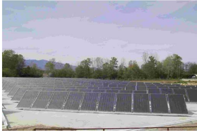
Dairy, Trikala, Greece

AEE - Institute for Sustainable Technologies Operating Agent for the Austrian Ministry of Transport, Innovation and Technology