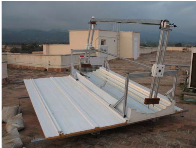
The CCStaR collector developed by the Universitat de les Illes Balears, Spain

Finally it has to be mentioned here that a new parabolic trough collector is developed in Australia. The NEP SOLAR Polymer Carrier PTC has an aperture width of about 1m and a new reflector design. It was set up for testing during the summer 2006 and it is planned that in 2007 it may come to the market.