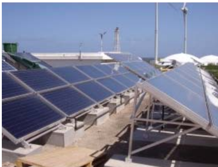
Sea water desalination Gran Canaria, Spain (Fraunhofer ISE, Germany)

Ongoing work in the laundry and metal surface treatment sectors, respectively, will be discussed in more detail at the next expert meeting scheduled for March 28 - 30, 2007 in Cologne, Germany.