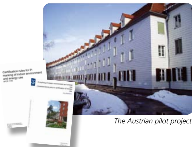
The Austrian pilot project

The QA system developed in the SQUARE project will be an important tool available to all building owners in the process of retrofitting their stock!